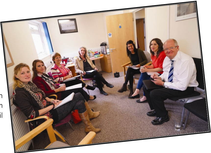
PMS team meeting with our partners from Portsmouth City Council