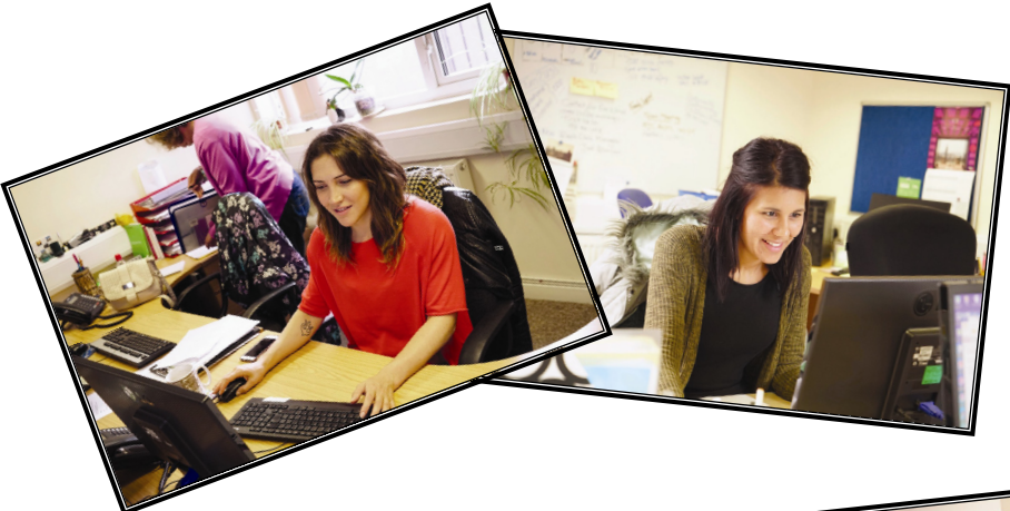
We need to keep good records and write accurate reports