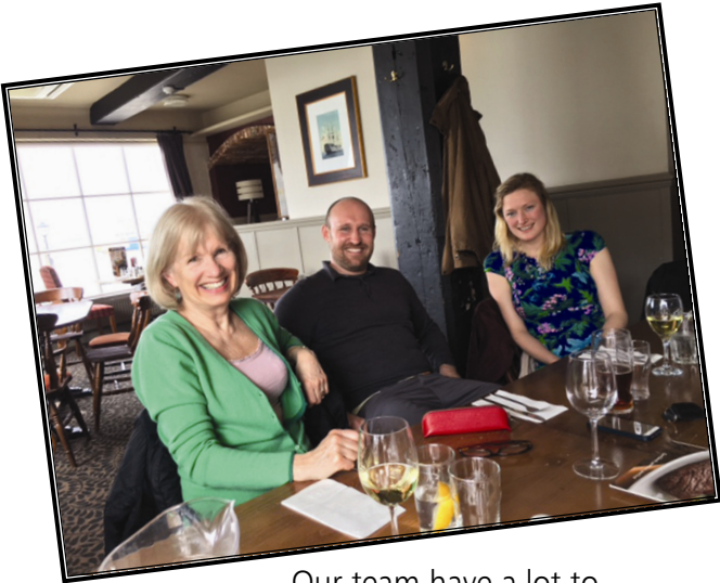
Our team have a lot to celebrate!