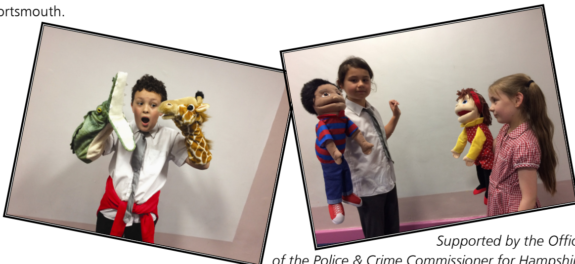
Supported by the Office of the Police & Crime Commissioner for Hampshire