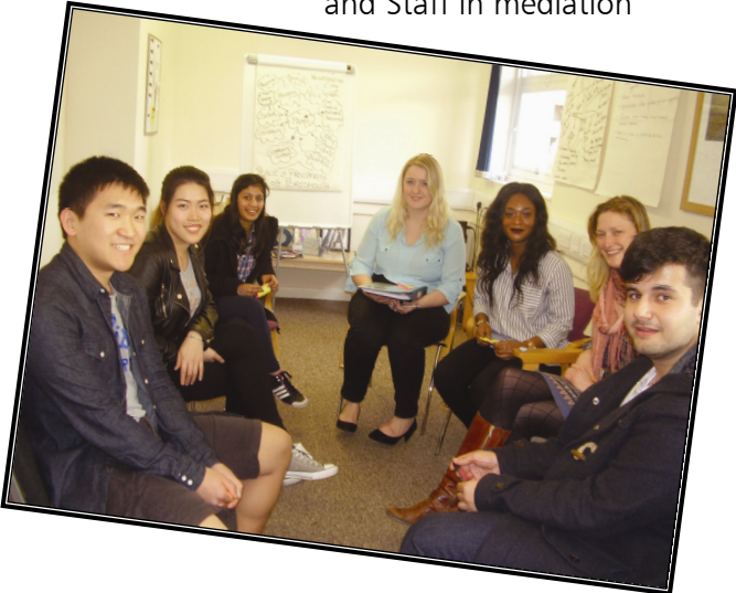
Training University Students and Staff in mediation